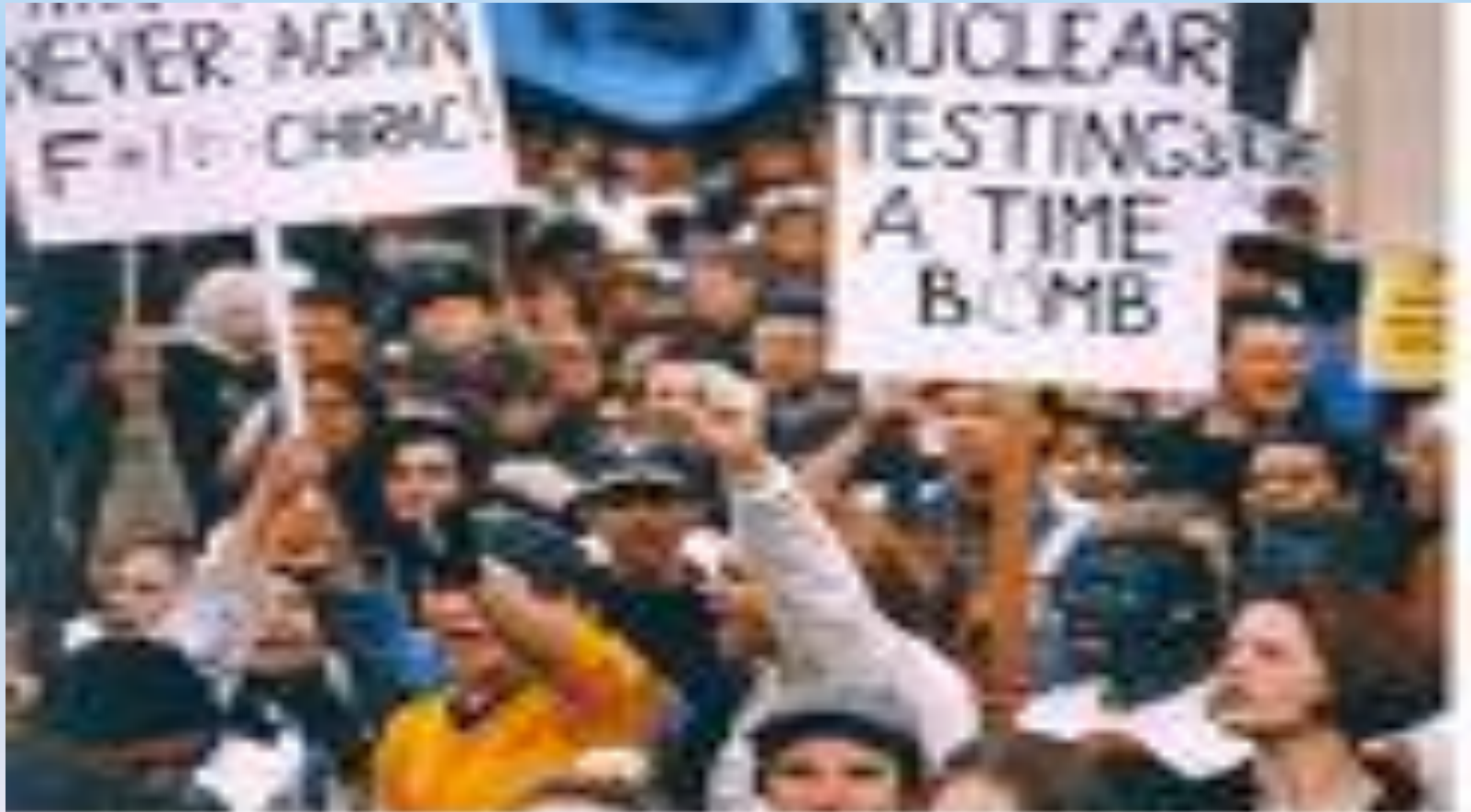
Sydney protest against French nuclear tests, 1995.