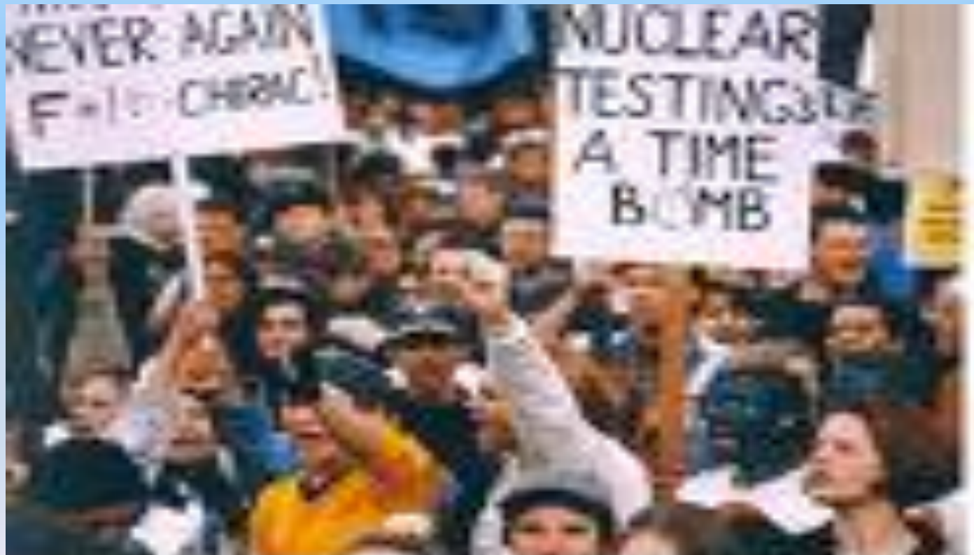
Sydney protest against French nuclear tests, 1995.