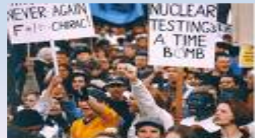
Sydney protest against French nuclear tests, 1995