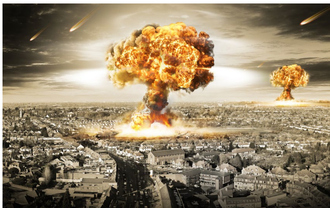
Fictional nuclear bomb explosions above city. The effects of a nuclear bomb explosion are indiscriminate.

In the meantime, these NGOs had been able to convince states like Switzerland, Austria