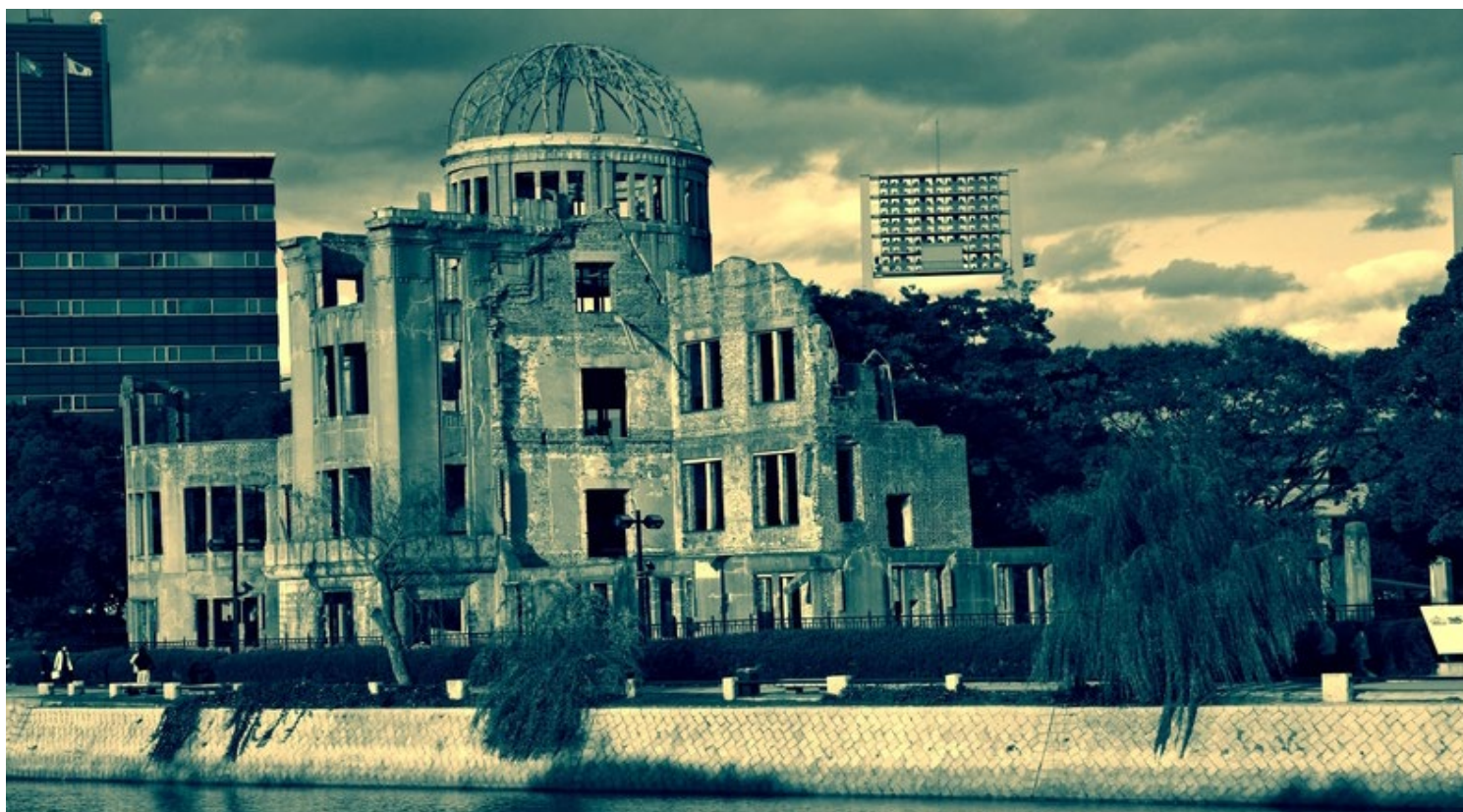
Hiroshima ground zero. Between 70,000 and 80,000 inhabitants of the city died immediately because of the bombing.