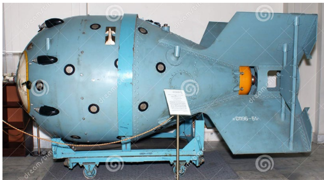
First Soviet nuclear bomb.

tens or hundreds of thousands of people dying if dropped on a city. 11 Because nuclear weapons by definition cannot make a distinction between civilians and the military their use is generally recognized (except by the NWS) as being contrary to international humanitarian law. 12 As a result, advocates of the humanitarian initiative propose that nuclear weapons should be banned, just as biological weapons (1972) and chemical weapons (1993), and more recently landmines (1997) and cluster munitions (2008) have been declared illegal.