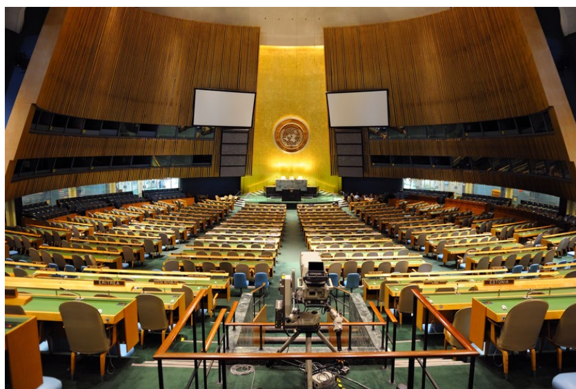
United Nations General Assembly Hall in New York. From April to May 2015, States Parties to the NPT will meet for the Treaty's Review Conference.

The upcoming Review Conference will be a test to what extent the humanitarian initiative has already become mainstream. Austria