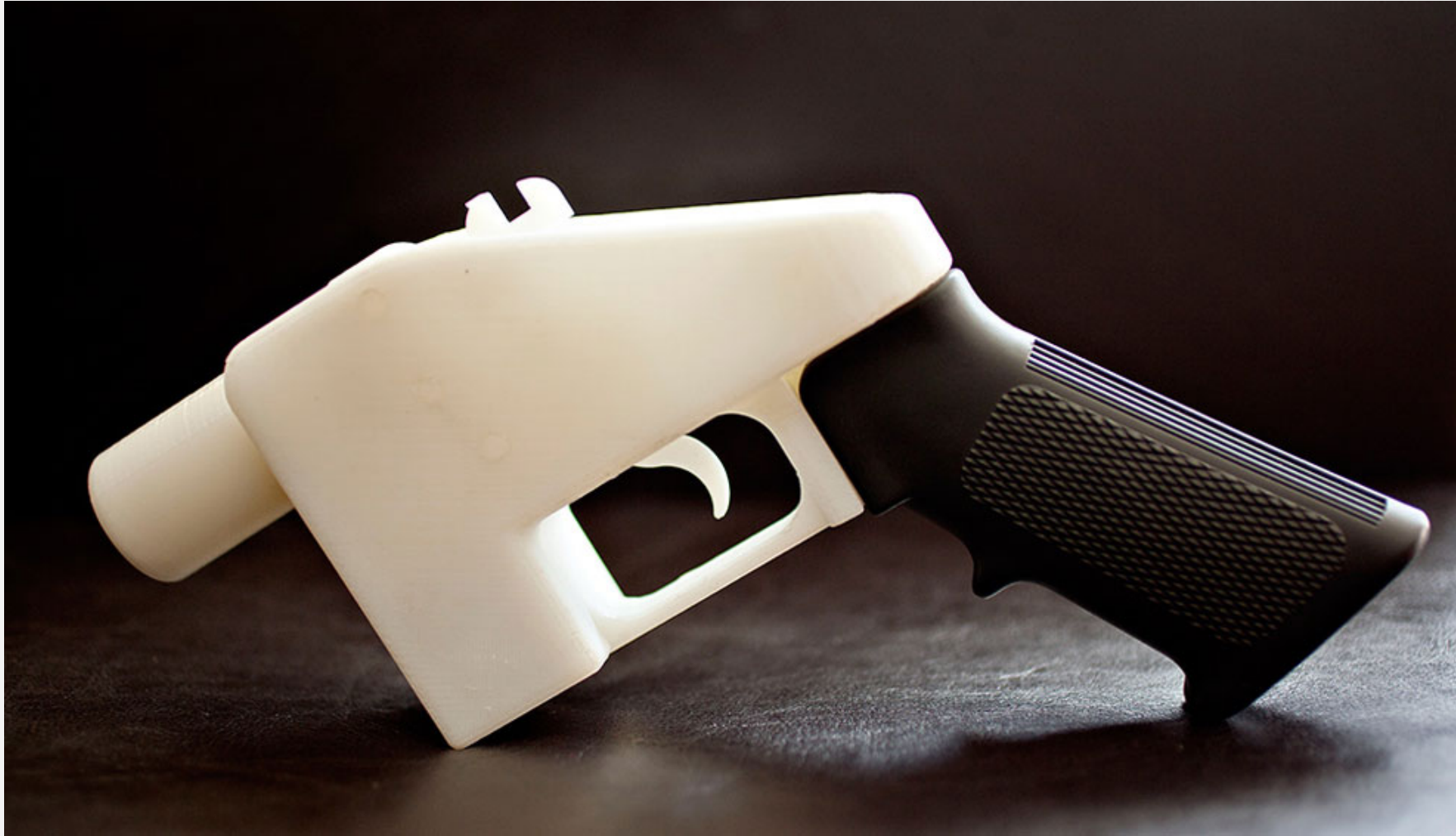
Defense Distributed: The Liberator (2013)